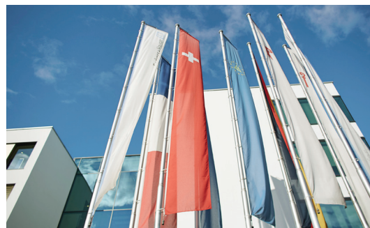
Open and transparent: the Sternenhof building in Reinach, Switzerland reflects the culture of Endress+Hauser

Endress+Hauser supports customers around the globe with a wide range of instruments, services and automation solutions for industrial process engineering.